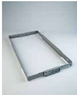
3 4 FACER-XL