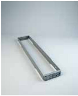
1 2 FACER-FRAME