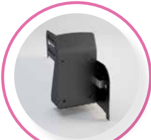
1 RTZ-V2 (METAL)