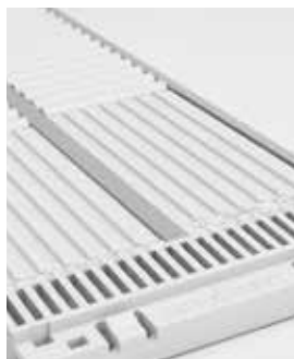
2 SHEET WITH PLATE (RT-HL P SHEET)