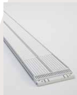
6 RTDO P