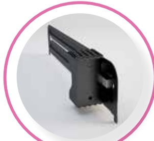
2 RTZ-MINI (METAL)