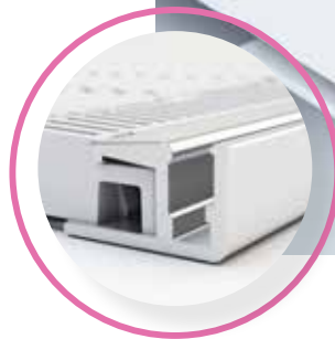
3 RT-STRIP SLIDABLE

If there is no existing ridge at the front of the shelf, use the RollerTrack™ Front profile.