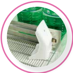
3 RTZ-X (ANODIZED ALUMINIUM)