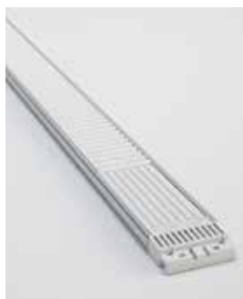
5 RTSO P