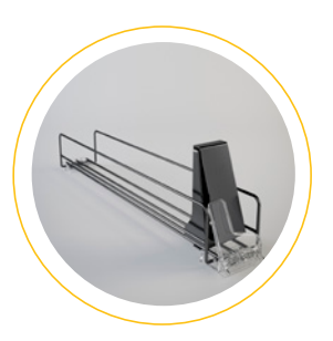
MU-MAX2-2M -P50 A4