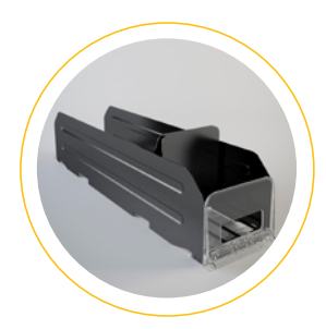
MU-MAX2-2M -P100 S8