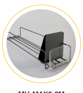
MU-MAX2-2M -P100 S8

Products below are a small selection of products within the Multivo™ Max range.