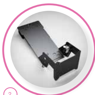
2 SHELF MOUNT ADJUSTABLE