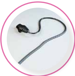
IDIS PT CABLE

Power Track™ works with a switch mode. It's easily fixed with tape or magnet depending on your shelving.