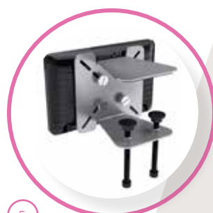
5 SHELF CLIP