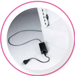
AC POWER ADAPTER