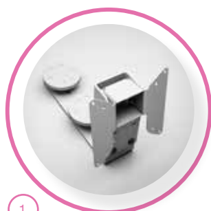
1 MAGNETIC MOUNT SHELF