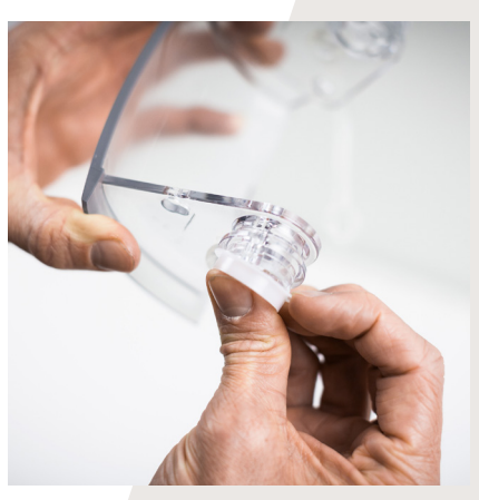
10. Remove both bearings from shutter's protruding circles.