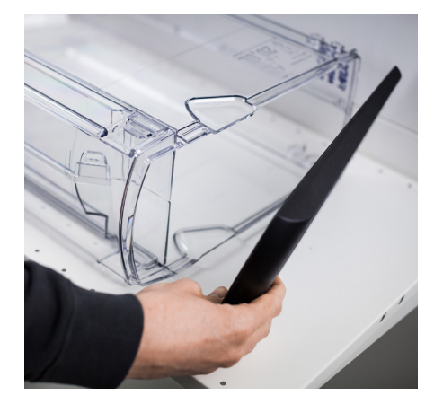
1. Remove top lid from bin body.