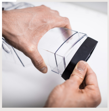
pushing it off.