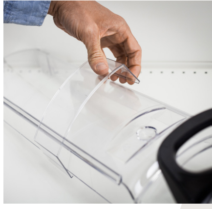
around and remove label holder.