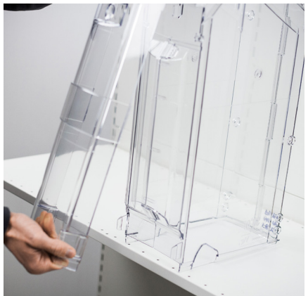
2. Press bin front's latches one at the 3. Remove clip - lift its fly upwards time to separate front from bin body. while pushing clip to the right. Remove bin front.