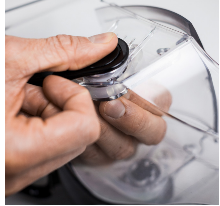
6. Place bin front on the side and unplug plugs. Press the plug downwards, and from the inside, pinch the two extremities of plug inwards.