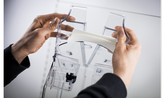
4 c. Repeat this procedure with the latch on the back of 4 d. When disconnecting the bin body halves, the shutter seal will come off as well.