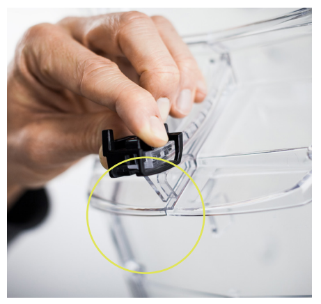
5. Make the bin stand with flow control towards you. Press encircled part to the left while sliding flow control towards you until it comes off.