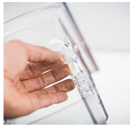
8. Turn bin front around and pull off 9. Disconnect shutter from bin front the two springs from their respective by pushing the encircled narrow circle hooks.