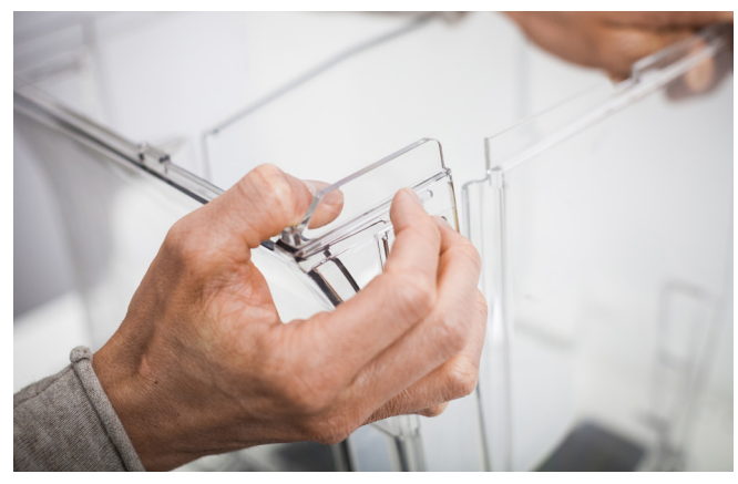
5. Hold bin in place using your one arm. At the same time, 6. Pull off internal signage holder from bin front. pull at the corner of bin front so it comes off. Do this for both sides.