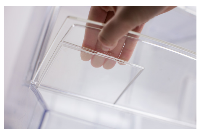
Lift the consumer lid and bend it outwards 4. Bend the right part of the bin body slightly outwards until the label holder falls off.