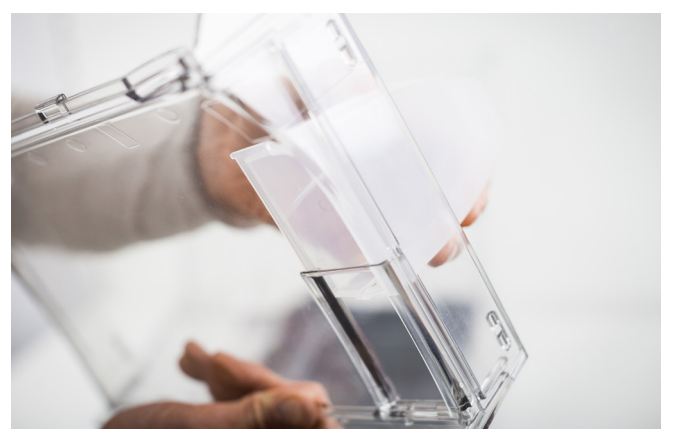
7. Pull off scoop holder from front.