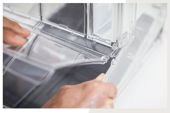
and unplug consumer lid from it. Do this for both sides.