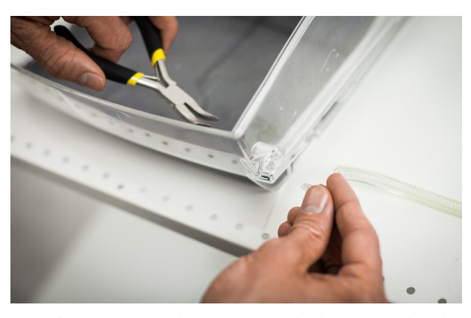
9 a. Using a tool such as a tong, grip the one end of the cord and push it out of bin body.