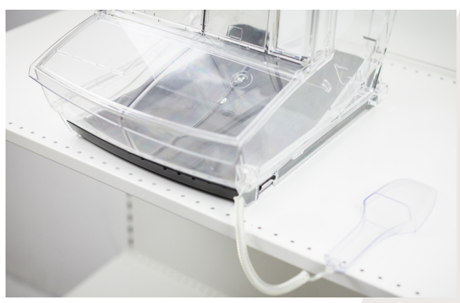
2. Remove scoop from scoop holder.