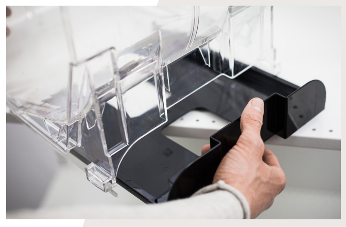
11. (If your bin doesn't have a catch tray, please skip this step.) Pull out catch tray holder completely. Your scoop bin is now fully disassembled.