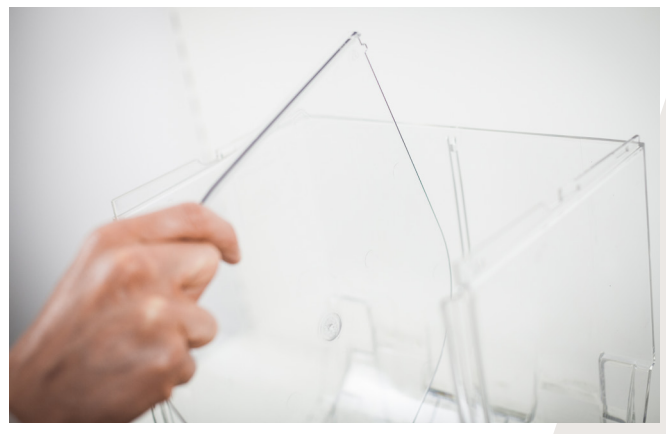
8. (If your bin doesn't have a divider, please skip this step.) Remove divider by unplugging it from its dedicated hole and slit in the back and front of bin body.