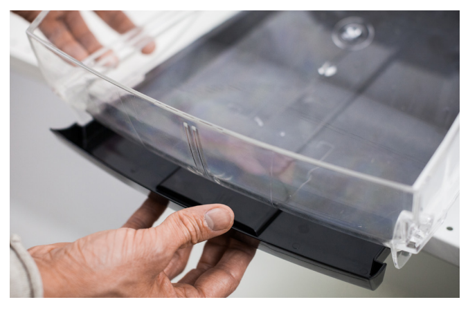
10. (If your bin doesn't have a catch tray, please skip this step.) Pull out catch tray completely.