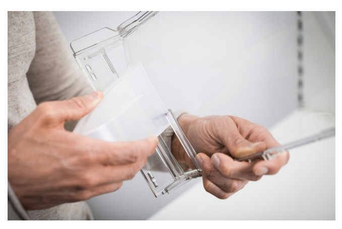
of bin front.