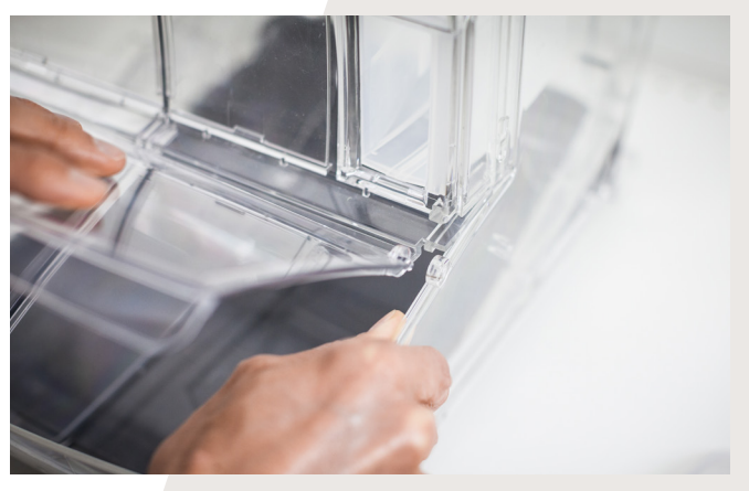
5. Insert consumer lid label holder into its dedicated 6. Bend the right part of the bin body slightly outwards and