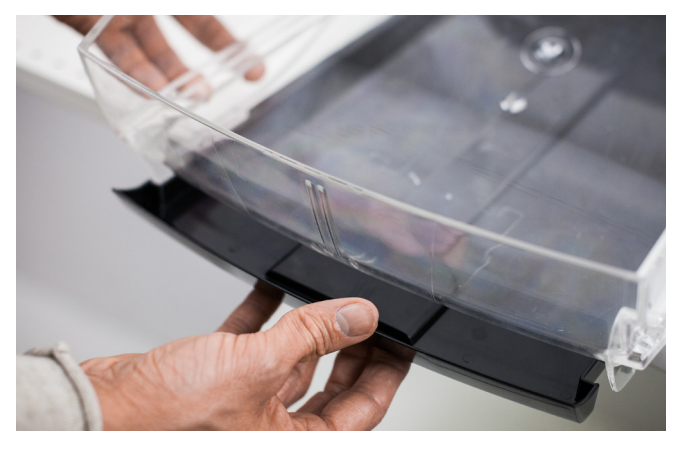
11. (If your bin doesn't have a catch tray, please skip this step.) Insert catch tray completely. Ensure catch tray sits between the catch tray holder and the bin body.