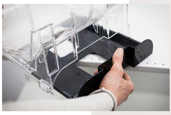
10. (If your bin doesn't have a catch tray, please skip this step.) Insert catch tray holder from the back. Ensure it locks into its dedicated holes.