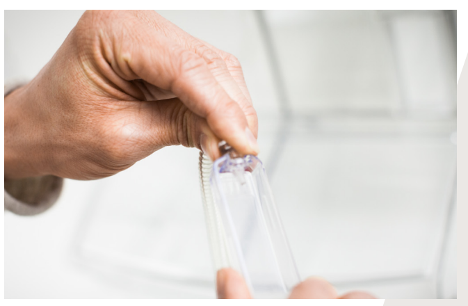
8. Insert cord into its dedicated hole in scoop. Insert cord into its dedicated hole on the side of the bin body.