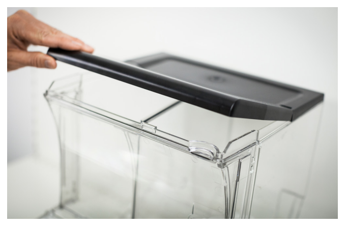
7. Attach top lid to bin.