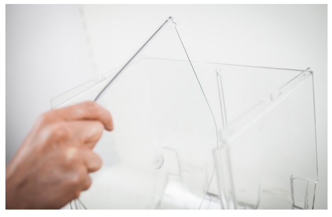
9. (If your bin doesn't have a divider, please skip this step.) Install divider by plugging it into its dedicated hole and slit in the back of bin body and in the slit in the front part of the bin body.