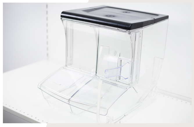
12. Insert scoop into scoop holder. Your scoop bin is now fully assembled.