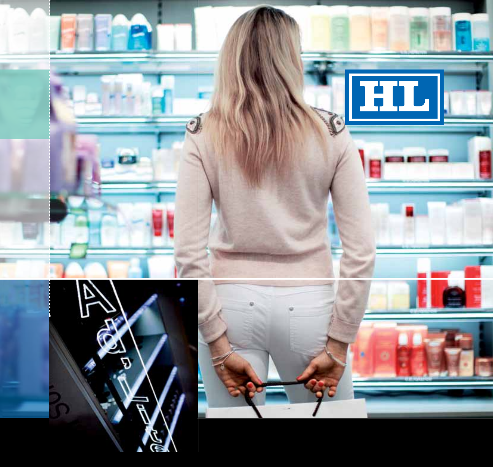
Brighten up your sales

Ad'Lite™-Makes your Product Presentation Visible and Profitable.